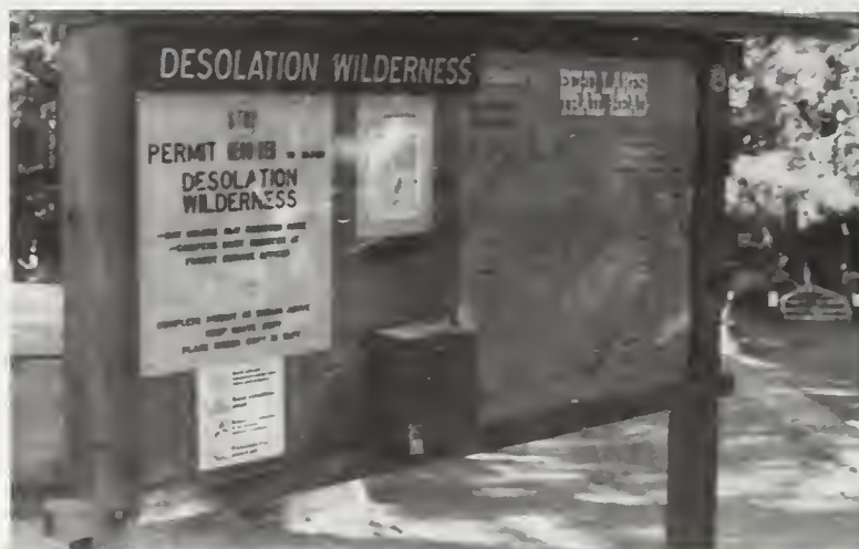
Figure 2 —Day-use permits can be obtained at Desolation Wilderness trailheads.

Service offices. Self-issued permits for day use are available at most entry points (fig. 2). During the summer, when overnight permits are restricted, they are available only from Forest Service offices. They may be obtained in advance.